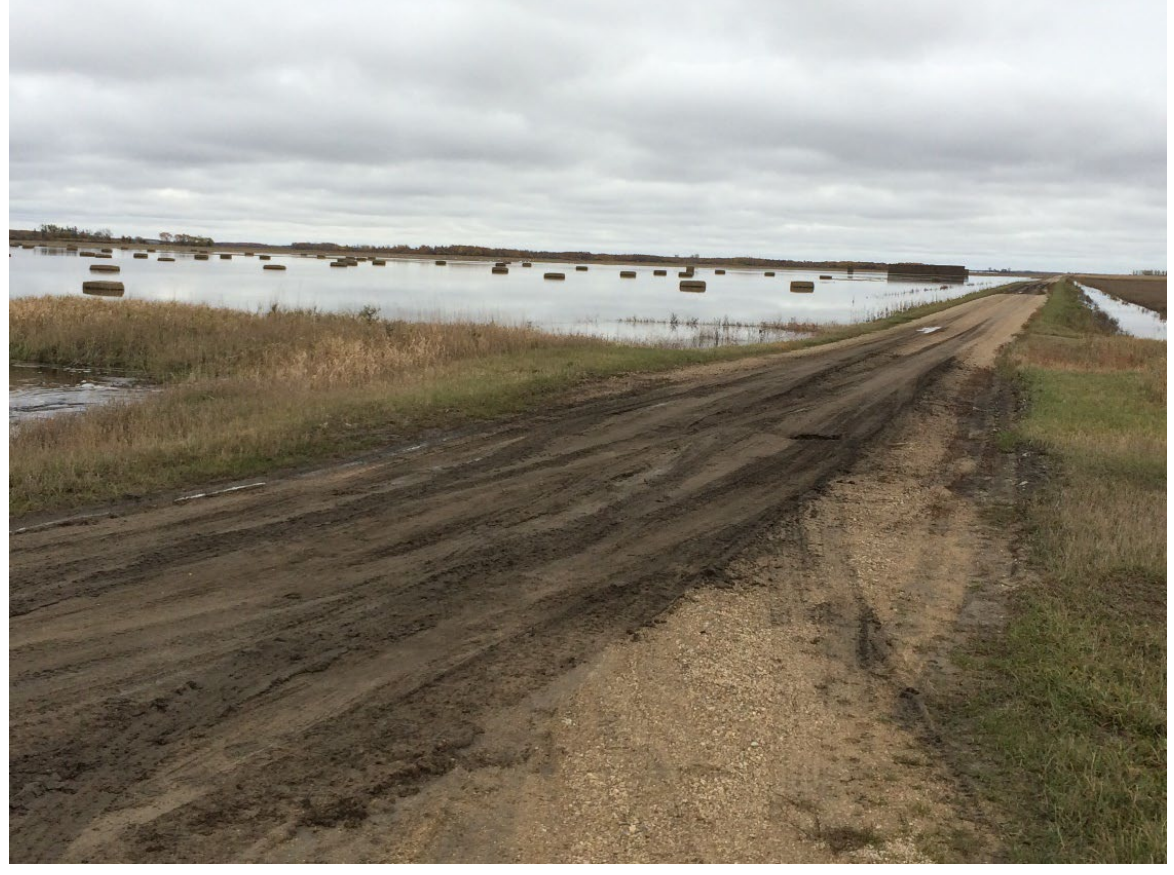
Looking SE at Section 6 Barto Twp – photo taken from NW corner of the section. Diversion will extend 4 miles south from here Diversion 160^{th} Ave Version 2.0 - 9/30/2022 Page 3