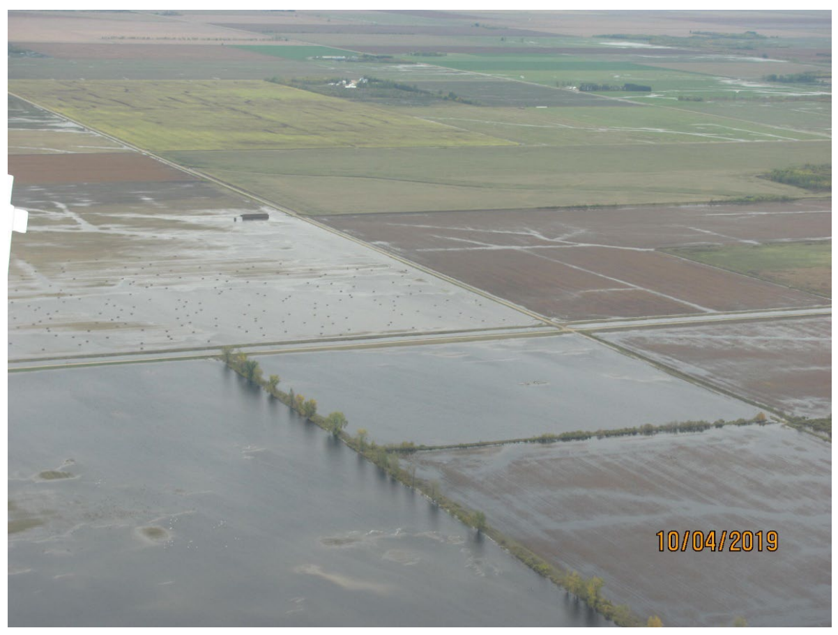
Looking South at Lat 1 SD 95: Sect 6 Barto Twp on left & Sect 1 Polonia Twp on right